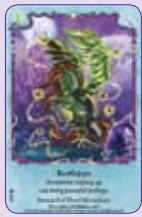
Beetlejape ○6/55 ◆S6/55