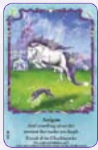
Anigan ○4/55 ◆S4/55