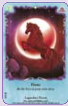
Fiona ○8/55 ◆S8/55