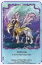
Ambrosia ○3/55 ◆S3/55