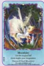
Moonfairy ○18/55 ◆S18/55