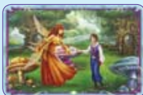
Moonstone ○51/55 ◆S51/55