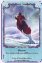
Merrow ○15/55 ◆S15/55