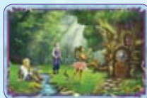
Fairy Door ○47/55 ◆S47/55