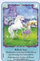
Bella & Sara ○40/55 ◆S40/55