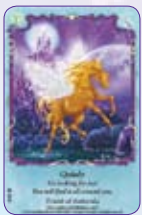
Quinly ○28/55 ◆S28/55