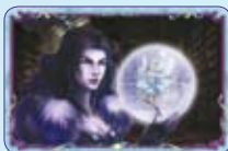
Fairy Globe ○46/55 ◆S46/55