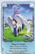
Wings & Emma ○43/55 ◆S43/55