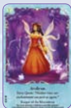
Avalynn ○44/55 ◆S44/55