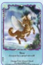
Twee ○37/55 ◆S37/55