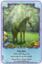
Gherkin ○10/55 ◆S10/55