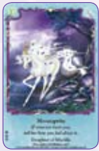
Moonsprite ○20/55 ◆S20/55