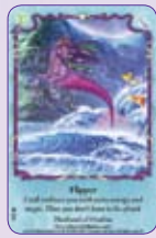
Flipper ○9/55 ◆S9/55