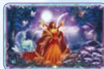
Awakening ○49/55 ◆S49/55