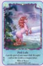
Pink Lady ○27/55 ◆S27/55