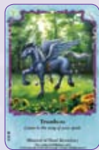
Trumbeau ○36/55 ◆S36/55