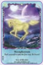
Moonphantom ○19/55 ◆S19/55