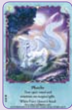
Phoebe ○26/55 ◆S26/55