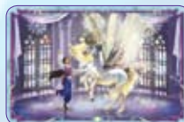
Moonfairy Found ○54/55 ◆S54/55