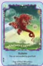
Ticklebit ○34/55 ◆S34/55