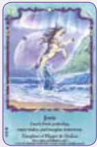
Janie ○11/55 ◆S11/55