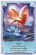
Mote ○21/55 ◆S21/55