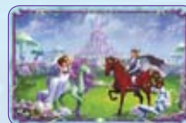
Fairytale Wedding ○55/55 ◆S55/55

© 2010 Hidden City Games, Inc. All rights reserved. BELLA SARA is a trademark of Concept Card APs and used by Hidden City Games under license. HIDDEN CITY GAMES and HIDDEN CITY ENTERTAINMENT are trademarks of Hidden City Games, Inc., in the U.S.A. and elsewhere. www.bellasara.com MRKT EN10889