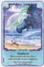
Nimblewit ○24/55 ◆S24/55