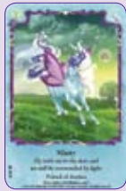
Minty ○16/55 ◆S16/55