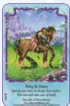
Twig & Deru ○42/55 ◆S42/55