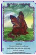
Anthea ○5/55 ◆S5/55