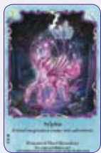
Sylphie ○31/55 ◆S31/55