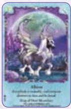
Albion ○2/55 ◆S2/55