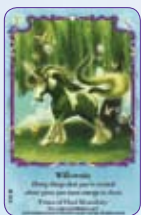
Willownix ○39/55 ◆S39/55