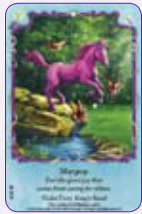
Maypop ○14/55 ◆S14/55