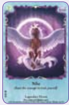
Nike ○23/55 ◆S23/55