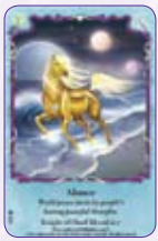
Alamar ○1/55 ◆S1/55