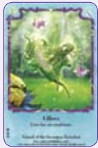
Lillova ○13/55 ◆S13/55