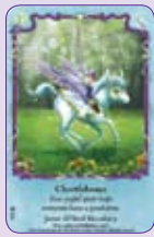
Chortlebones ○7/55 ◆S7/55