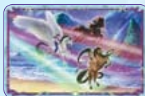
Riding on Moonbeams ○52/55 ◆S52/55