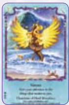
Sirena ○30/55 ◆S30/55