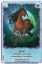
Jewel ○12/55 ◆S12/55