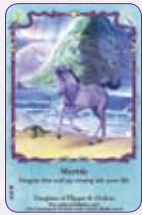
Murttie ○22/55 ◆S22/55