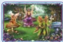
Fairy Court ○48/55 ◆S48/55