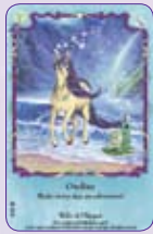
Ondine ○25/55 ◆S25/55