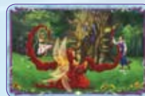
Lovers Reunited ○50/55 ◆S50/55