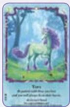
Tiara ○33/55 ◆S33/55