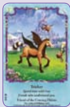
Tricksy ○35/55 ◆S35/55