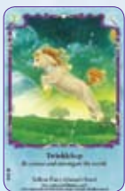
Twinklehop ○38/55 ◆S38/55