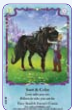
Soot & Colm ○41/55 ◆S41/55