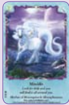
Mireldis ○17/55 ◆S17/55